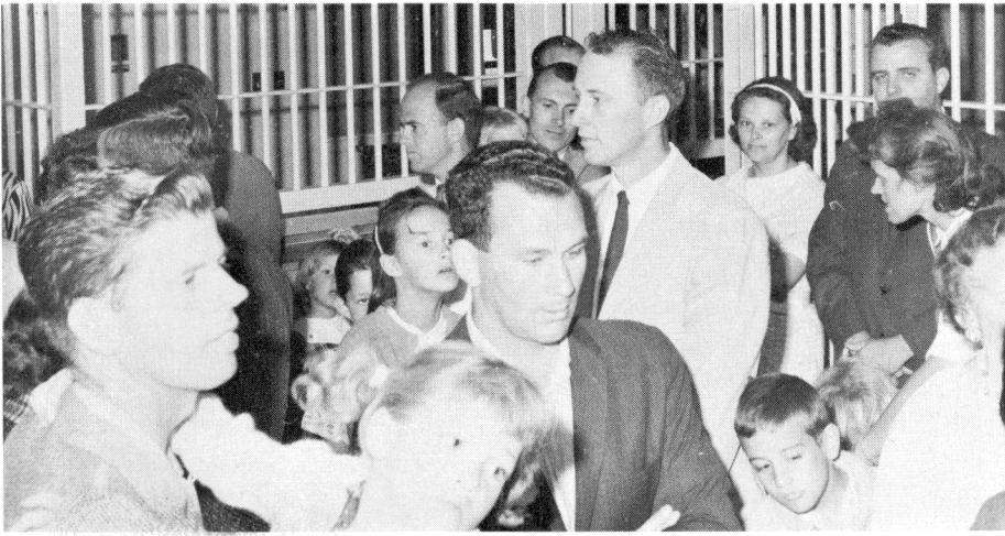
JAILED CLUB —The Glendale Spokesman Club, with families and guests, find themselves locked up behind bars during tour of Glendale Police Department.