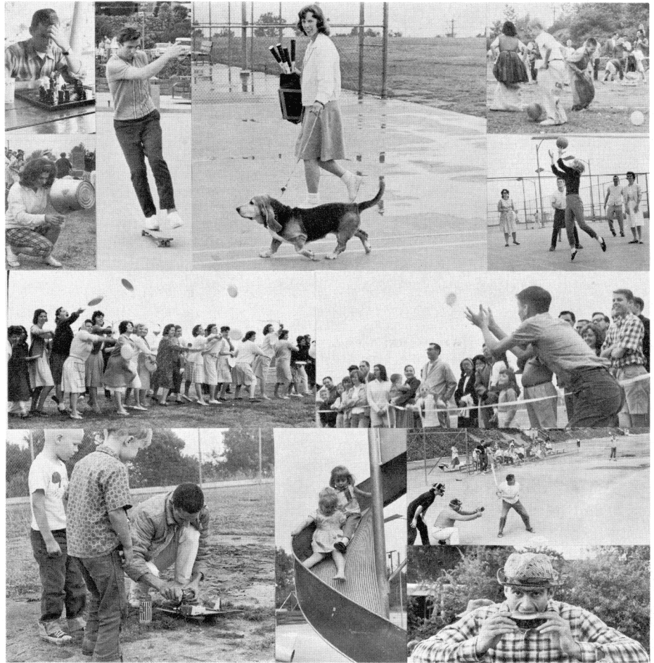
PICNIC PANORAMA—This composite of the various activities at Pasadena social illustrates the "Something for Everyone" theme.

The main meeting hall seats over 400 and yet is compact and spacious all at once. All of this costs no more than the old hall for our 270-plus people. When God blesses us, He does it big!