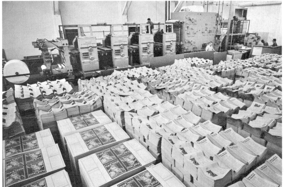
MAIN PRESS —Key to publishing division's new expansion program is this giant web press. Here you see part of June PLAIN TRUTH in foreground. WHO WILL RULE SPACE? was first full-color booklet printed on the press.