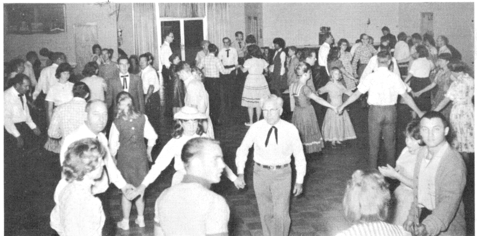
FAMILY DANCE —With derby hats, red armgarters, bonnets and bustles, the Fontana members enjoy a "Gay Nineties" square dance.

It truly was a GAY Nineties night of food, fellowship and fun!